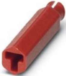
Coding profile for HC-D 7-EBUC-COD socket contact inserts

Please be informed that the data shown in this PDF Document is generated from our Online Catalog. Please find the complete data in the user's documentation. Our General Terms of Use for Downloads are valid ( http://phoenixcontact.com/download )