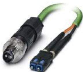
Assembled FO cable, round cable, 980/1000 µm POF fiber, M12 fiber optic connector to SC-RJ/IP20

Please be informed that the data shown in this PDF Document is generated from our Online Catalog. Please find the complete data in the user's documentation. Our General Terms of Use for Downloads are valid ( http://phoenixcontact.com/download )