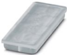
Coated protective cover for the housing on the motor side

Please be informed that the data shown in this PDF Document is generated from our Online Catalog. Please find the complete data in the user's documentation. Our General Terms of Use for Downloads are valid ( http://phoenixcontact.com/download )