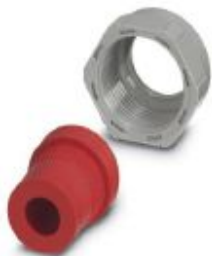
Pg16 screw connection accessories for box mounting base with cable diameter 9 mm ... 12 mm

Please be informed that the data shown in this PDF Document is generated from our Online Catalog. Please find the complete data in the user's documentation. Our General Terms of Use for Downloads are valid ( http://phoenixcontact.com/download )