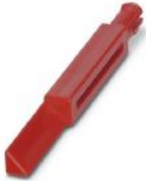
Coding profile for Q12 series

Please be informed that the data shown in this PDF Document is generated from our Online Catalog. Please find the complete data in the user's documentation. Our General Terms of Use for Downloads are valid ( http://phoenixcontact.com/download )