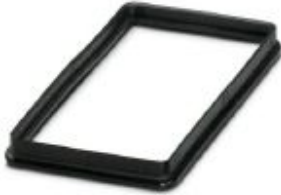
Profile gasket for sleeve housing type B10.....EEE

Please be informed that the data shown in this PDF Document is generated from our Online Catalog. Please find the complete data in the user's documentation. Our General Terms of Use for Downloads are valid ( http://phoenixcontact.com/download )