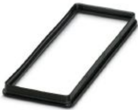
Profile gasket for sleeve housing type B24.....EEE

Please be informed that the data shown in this PDF Document is generated from our Online Catalog. Please find the complete data in the user's documentation. Our General Terms of Use for Downloads are valid ( http://phoenixcontact.com/download )