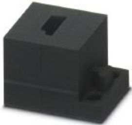
Small, slotted cable sleeves suitable for one AS-i cable, material: NBR, version: left

Please be informed that the data shown in this PDF Document is generated from our Online Catalog. Please find the complete data in the user's documentation. Our General Terms of Use for Downloads are valid ( http://phoenixcontact.com/download )