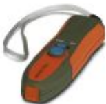
Red light source (650 nm)

FO accessories - FOC-TOOL-LIGHTSOURCE-650 - 1414098