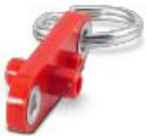
Red light source adapter

FO accessories - FOC-TOOL-LIGHTSOURCE-ADAPTER - 1414097