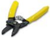
Fiber stripper for AWG 22 - 10 / (0.6 ... 2.6 mm)

FO accessories - FOC-TOOL-STRIPPING-FA-2 - 1414100