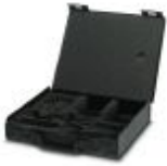
Replacement case, empty

FO accessories - FOC-TOOL-CASE-EMPTY - 1414095