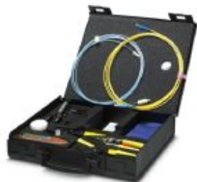
Tool set for GOF assembly

Please be informed that the data shown in this PDF Document is generated from our Online Catalog. Please find the complete data in the user's documentation. Our General Terms of Use for Downloads are valid ( http://phoenixcontact.com/download )