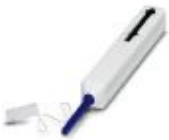
Ferrule cleaner, 1.25 mm, for LC, approx. 500 cleaning cycles

FO accessories - FOC-TOOL-FERRULECLEANER-1.25 - 1407032