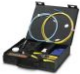
Tool set for GOF assembly

Tool set - FOC-TOOL-GOF KONF SET - 1411049