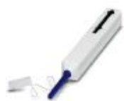
Ferrule cleaner, 1.25 mm, for LC, approx. 500 cleaning cycles