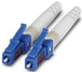
LC duplex connector, with long bend protection, for single mode 9/125 µm, PC polishing, blue

Please be informed that the data shown in this PDF Document is generated from our Online Catalog. Please find the complete data in the user's documentation. Our General Terms of Use for Downloads are valid ( http://phoenixcontact.com/download )