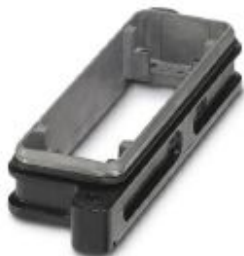
HEAVYCON B24 panel mounting base, HPR series, for screw locking, for increased environmental and EMC requirements

Please be informed that the data shown in this PDF Document is generated from our Online Catalog. Please find the complete data in the user's documentation. Our General Terms of Use for Downloads are valid ( http://phoenixcontact.com/download )