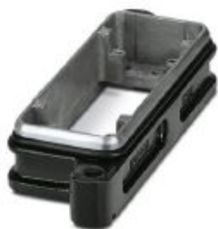
HEAVYCON B16 panel mounting base, HPR series, for screw locking, for increased environmental and EMC requirements

Please be informed that the data shown in this PDF Document is generated from our Online Catalog. Please find the complete data in the user's documentation. Our General Terms of Use for Downloads are valid ( http://phoenixcontact.com/download )