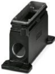
HEAVYCON B24 box mounting base, for screw locking, HPR series, with 2 x M40 gland, for increased environmental and EMC requirements

Please be informed that the data shown in this PDF Document is generated from our Online Catalog. Please find the complete data in the user's documentation. Our General Terms of Use for Downloads are valid ( http://phoenixcontact.com/download )