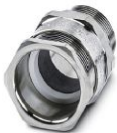
Cable gland, cable gland material: Nickel-plated brass, application: Ex, external cable diameter 23.5 mm ... 32.2 mm, shielding: no, connecting thread: M40 x 1.5, color: silver

Please be informed that the data shown in this PDF Document is generated from our Online Catalog. Please find the complete data in the user's documentation. Our General Terms of Use for Downloads are valid ( http://phoenixcontact.com/download )