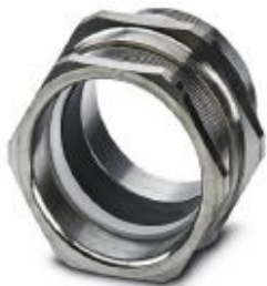
Cable gland, cable gland material: Nickel-plated brass, application: Ex, external cable diameter 35.6 mm ... 44.1 mm, shielding: no, connecting thread: M50 x 1.5, color: silver

Please be informed that the data shown in this PDF Document is generated from our Online Catalog. Please find the complete data in the user's documentation. Our General Terms of Use for Downloads are valid ( http://phoenixcontact.com/download )