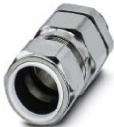
Cable gland, cable gland material: Nickel-plated brass, application: Ex, external cable diameter 18.2 mm ... 26.2 mm, shielding: yes, connecting thread: M25 x 1.5, color: silver

Please be informed that the data shown in this PDF Document is generated from our Online Catalog. Please find the complete data in the user's documentation. Our General Terms of Use for Downloads are valid ( http://phoenixcontact.com/download )