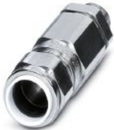
Cable gland, cable gland material: Stainless steel 316L, application: Ex, external cable diameter 18.2 mm ... 26.2 mm, shielding: yes, connecting thread: M25 x 1.5, color: silver

Please be informed that the data shown in this PDF Document is generated from our Online Catalog. Please find the complete data in the user's documentation. Our General Terms of Use for Downloads are valid ( http://phoenixcontact.com/download )