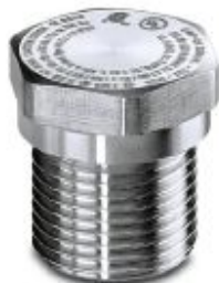
Screw plug, cable gland material: Nickel-plated brass, application: Ex, connecting thread: M25 x 1.5, color: silver

Please be informed that the data shown in this PDF Document is generated from our Online Catalog. Please find the complete data in the user's documentation. Our General Terms of Use for Downloads are valid ( http://phoenixcontact.com/download )