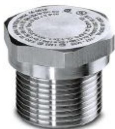
Screw plug, cable gland material: Stainless steel 316L, application: Ex, connecting thread: M25 x 1.5, color: silver

Please be informed that the data shown in this PDF Document is generated from our Online Catalog. Please find the complete data in the user's documentation. Our General Terms of Use for Downloads are valid ( http://phoenixcontact.com/download )