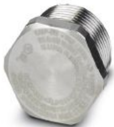
Screw plug, cable gland material: Nickel-plated brass, application: Ex, connecting thread: M32 x 1.5, color: silver

Please be informed that the data shown in this PDF Document is generated from our Online Catalog. Please find the complete data in the user's documentation. Our General Terms of Use for Downloads are valid ( http://phoenixcontact.com/download )