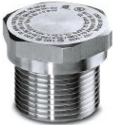
Screw plug, cable gland material: Stainless steel 316L, application: Ex, connecting thread: M32 x 1.5, color: silver

Please be informed that the data shown in this PDF Document is generated from our Online Catalog. Please find the complete data in the user's documentation. Our General Terms of Use for Downloads are valid ( http://phoenixcontact.com/download )