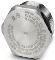
Screw plug, cable gland material: Nickel-plated brass, application: Ex, connecting thread: M50 x 1.5, color: silver

Please be informed that the data shown in this PDF Document is generated from our Online Catalog. Please find the complete data in the user's documentation. Our General Terms of Use for Downloads are valid ( http://phoenixcontact.com/download )