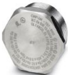
Screw plug, cable gland material: Stainless steel 316L, application: Ex, connecting thread: M63 x 1.5, color: silver

Please be informed that the data shown in this PDF Document is generated from our Online Catalog. Please find the complete data in the user's documentation. Our General Terms of Use for Downloads are valid ( http://phoenixcontact.com/download )