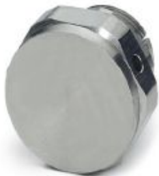
Pressure compensation element, material: Brass, nickel-plated, application: Ex, connecting thread: M25 x 1.5, color: silver

Please be informed that the data shown in this PDF Document is generated from our Online Catalog. Please find the complete data in the user's documentation. Our General Terms of Use for Downloads are valid ( http://phoenixcontact.com/download )