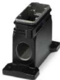
HEAVYCON B6 box mounting base, for screw locking, HPR series, with 2 x M25 gland, for increased environmental and EMC requirements

Please be informed that the data shown in this PDF Document is generated from our Online Catalog. Please find the complete data in the user's documentation. Our General Terms of Use for Downloads are valid ( http://phoenixcontact.com/download )