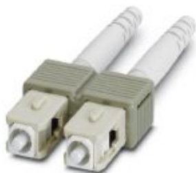
SC duplex connector, with long bend protection, for multi-mode 50/125 µm, beige

Please be informed that the data shown in this PDF Document is generated from our Online Catalog. Please find the complete data in the user's documentation. Our General Terms of Use for Downloads are valid ( http://phoenixcontact.com/download )