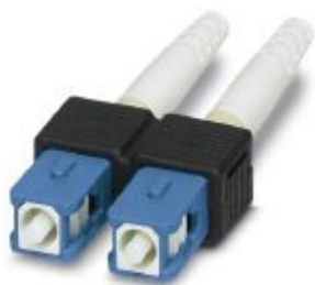
SC duplex connector, with long bend protection, for single mode 9/125 µm, PC polishing, blue

Please be informed that the data shown in this PDF Document is generated from our Online Catalog. Please find the complete data in the user's documentation. Our General Terms of Use for Downloads are valid ( http://phoenixcontact.com/download )