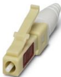
LC connector, with short bend protection (pigtail), for multi-mode 50/125 µm, beige

Please be informed that the data shown in this PDF Document is generated from our Online Catalog. Please find the complete data in the user's documentation. Our General Terms of Use for Downloads are valid ( http://phoenixcontact.com/download )