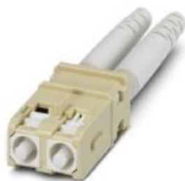
SC-RJ connector, with long bend protection, multi-mode 50/125 μm, beige, value pack: 10 pcs.

Please be informed that the data shown in this PDF Document is generated from our Online Catalog. Please find the complete data in the user's documentation. Our General Terms of Use for Downloads are valid ( http://phoenixcontact.com/download )