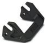
Single locking latch for B10 housing, HC-EVO....AL and HC-STA....AL

Replacement part - HC-STA-B10-SL-PLBK - 1412804