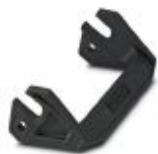
Single locking latch for B16 housing, HC-EVO....AL and HC-STA....AL

Replacement part - HC-STA-B16-SL-PLBK - 1412284