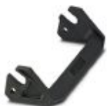
Single locking latch for B24 housing, HC-EVO....AL and HC-STA....AL

Replacement part - HC-STA-B24-SL-PLBK - 1412885