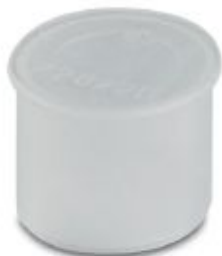
Protective cap, transparent plastic, for 5x 6.0 mm 2 QPD QUICKON connection, IP50.

Please be informed that the data shown in this PDF Document is generated from our Online Catalog. Please find the complete data in the user's documentation. Our General Terms of Use for Downloads are valid ( http://phoenixcontact.com/download )