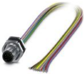
Flush-type connector, Universal, 12-position, Plug, M12, A-coded, Rear mounting, M16 x 1.5, Individual wires, cable length: 0.5 m, 0.14 mm 2 , TPE litz wire

Please be informed that the data shown in this PDF Document is generated from our Online Catalog. Please find the complete data in the user's documentation. Our General Terms of Use for Downloads are valid ( http://phoenixcontact.com/download )