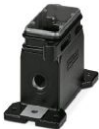
HEAVYCON B6 box mounting base, for screw locking, HPR series, with 2 x M20 gland, for increased environmental and EMC requirements

Please be informed that the data shown in this PDF Document is generated from our Online Catalog. Please find the complete data in the user's documentation. Our General Terms of Use for Downloads are valid ( http://phoenixcontact.com/download )