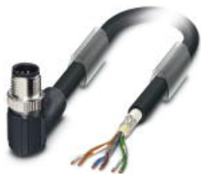
Bus system cable, VARAN, 6-position, PVC, black, shielded, cable length: 2 m, Customer version

Please be informed that the data shown in this PDF Document is generated from our Online Catalog. Please find the complete data in the user's documentation. Our General Terms of Use for Downloads are valid ( http://phoenixcontact.com/download )