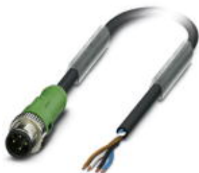
Sensor/actuator cable, 4-position, PUR halogen-free, black-gray RAL 7021, Plug straight M12 SPEEDCON, B-coded, on free cable end, cable length: 2 m

Please be informed that the data shown in this PDF Document is generated from our Online Catalog. Please find the complete data in the user's documentation. Our General Terms of Use for Downloads are valid ( http://phoenixcontact.com/download )