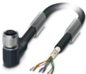
Bus system cable, VARAN, 6-position, PVC, black, shielded, cable length: 2 m, Customer version

Please be informed that the data shown in this PDF Document is generated from our Online Catalog. Please find the complete data in the user's documentation. Our General Terms of Use for Downloads are valid ( http://phoenixcontact.com/download )