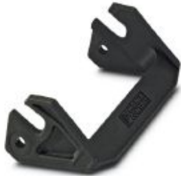
Single locking latch for B16 housing, HC-EVO...AL and HC-STA...AL

Please be informed that the data shown in this PDF Document is generated from our Online Catalog. Please find the complete data in the user's documentation. Our General Terms of Use for Downloads are valid ( http://phoenixcontact.com/download )