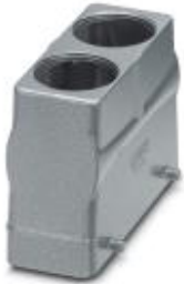
HEAVYCON B24 sleeve housing, for double locking latch, height: 76 mm, with 2 x M40 thread, straight cable outlet

Please be informed that the data shown in this PDF Document is generated from our Online Catalog. Please find the complete data in the user's documentation. Our General Terms of Use for Downloads are valid ( http://phoenixcontact.com/download )