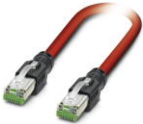
Patch cable, degree of protection: IP20, number of positions: 4

Please be informed that the data shown in this PDF Document is generated from our Online Catalog. Please find the complete data in the user's documentation. Our General Terms of Use for Downloads are valid ( http://phoenixcontact.com/download )