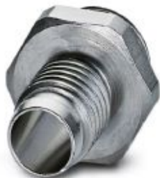
M8 pin, front mounting SMD with M10 screw fastening

Please be informed that the data shown in this PDF Document is generated from our Online Catalog. Please find the complete data in the user's documentation. Our General Terms of Use for Downloads are valid ( http://phoenixcontact.com/download )