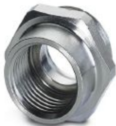
M8 female connector, front mounting SMD with M10 screw fastening

Please be informed that the data shown in this PDF Document is generated from our Online Catalog. Please find the complete data in the user's documentation. Our General Terms of Use for Downloads are valid ( http://phoenixcontact.com/download )