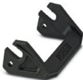
Single locking latch for B10 housing, HC-EVO...AL and HC-STA...AL

Please be informed that the data shown in this PDF Document is generated from our Online Catalog. Please find the complete data in the user's documentation. Our General Terms of Use for Downloads are valid ( http://phoenixcontact.com/download )