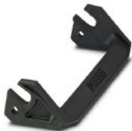
Single locking latch for B24 housing, HC-EVO...AL and HC-STA...AL

Please be informed that the data shown in this PDF Document is generated from our Online Catalog. Please find the complete data in the user's documentation. Our General Terms of Use for Downloads are valid ( http://phoenixcontact.com/download )