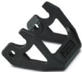
Double locking latch for B10 / B16 / B24 housing, HC-EVO....AL and HC-STA....AL

Please be informed that the data shown in this PDF Document is generated from our Online Catalog. Please find the complete data in the user's documentation. Our General Terms of Use for Downloads are valid ( http://phoenixcontact.com/download )