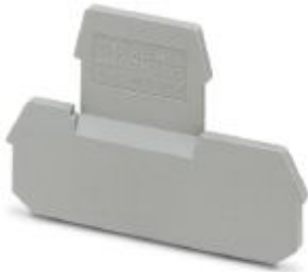
End cover, length: 62 mm, width: 5 mm, height: 40 mm, color: gray

Please be informed that the data shown in this PDF Document is generated from our Online Catalog. Please find the complete data in the user's documentation. Our General Terms of Use for Downloads are valid ( http://phoenixcontact.com/download )