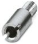
Female test connector, color: silver

Female test connector - PSB 3/10/4 - 0601292