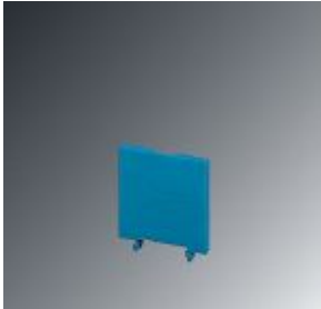
End cover, length: 28 mm, width: 2.5 mm, height: 30.2 mm, color: blue

Please be informed that the data shown in this PDF Document is generated from our Online Catalog. Please find the complete data in the user's documentation. Our General Terms of Use for Downloads are valid ( http://phoenixcontact.com/download )